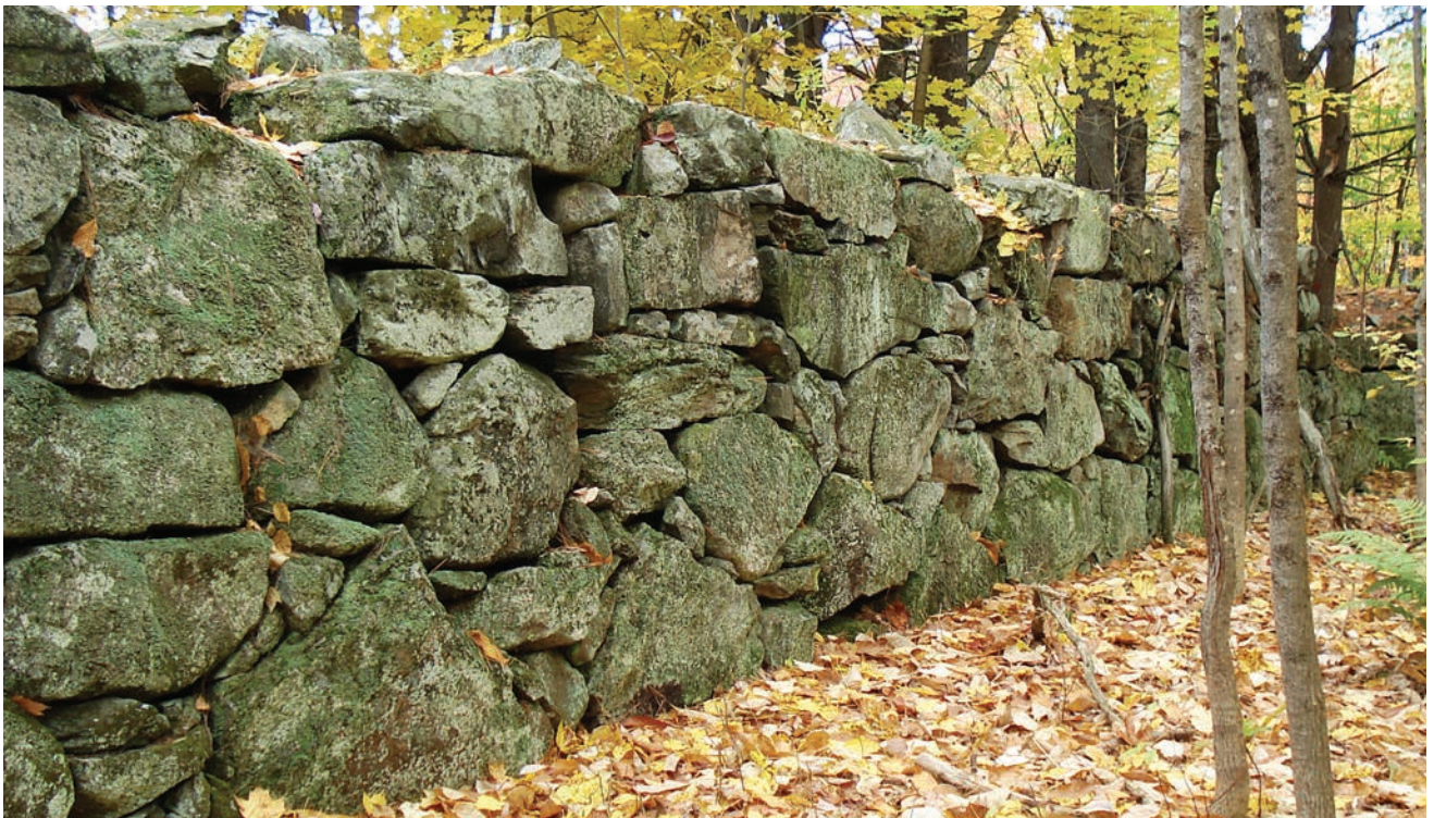
The Stone Farm in Dunbarton includes 237 acres of farmland, fields, and forest. Conserved in 2017 by Five Rivers Conservation Trust.

Real estate. Land and buildings, including any associated natural features (e.g., trees, stones, etc.) and manmade features (e.g., fences, wells, etc.), and any and all legal rights