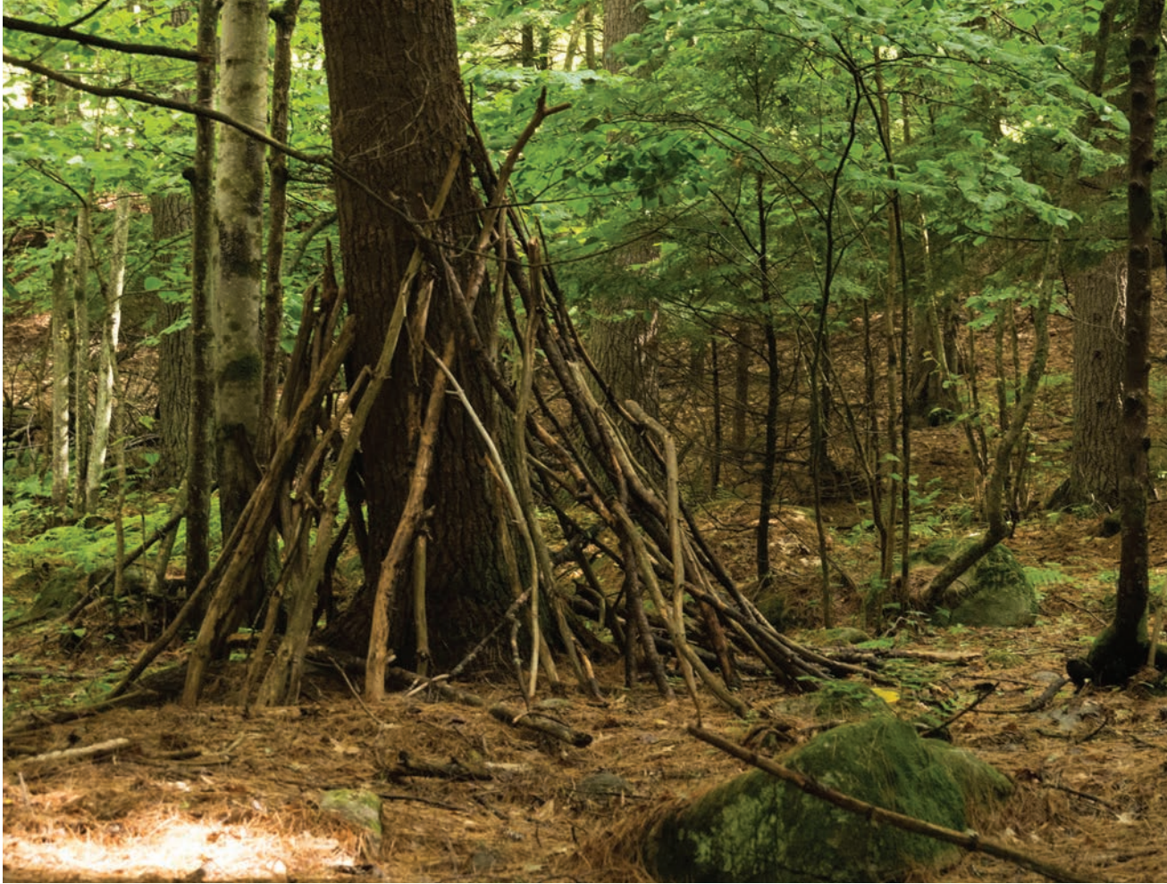
A fort built by children on the Allen Family Forest, which is used as an outdoor laboratory and classroom by the Marlborough School.

no longer meets the minimum acreage. When a land use change occurs, the current landowner pays a “land use change tax” equal to 10 percent of the fair market value of that portion of the property on which the use has changed. Property in Current Use may be developed at any time (triggering the land use change tax and removal from the Current Use program), after which there are no restrictions on land use.