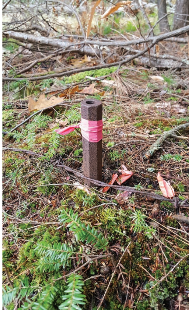
Old gun barrel used as a boundary marker.

National land trust standards and practices require land trusts to plan for the future stewardship needs of the organization and the