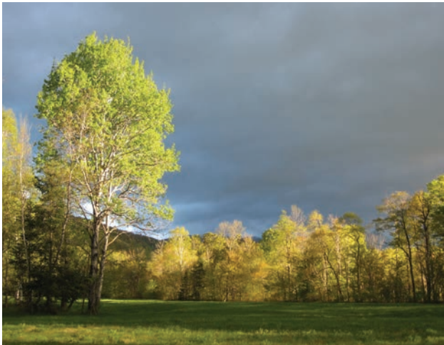
Harding Easement.

Sometimes a piece of land is more than it appears to be. Perhaps it provides food for moose and bear, river access for beavers, otters, and mink, or safe nesting for meadowlarks and bluebirds. Maybe it is part of a wildlife corridor or offers views of unspoiled mountains. When we bought our land in 1974, we were just beginning to see what treats our land held. To this day, we continue to learn from and about the land, now with the help of the Upper Saco Valley Land Trust (USVLT)