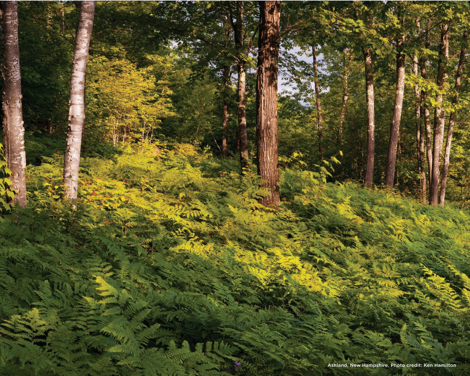
Ashland, New Hampshire.

“My brothers and I have a deep sense of history with the land and many memories from growing up here. We wanted to leave a legacy to our children like the one that had been left to us.”