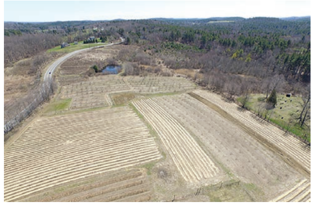
An aerial view of Monahan Farm.