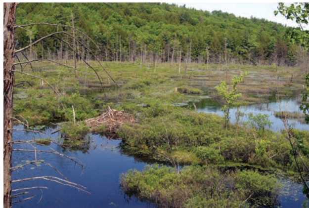
Courser Farm lands.