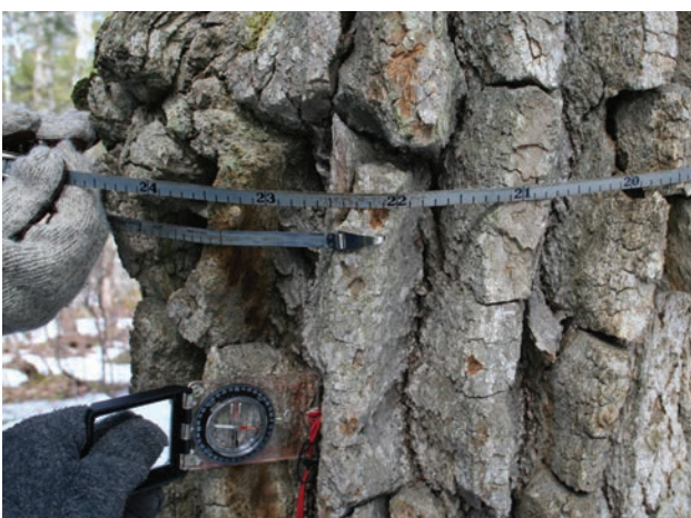
A 300 year old black gum on the Mulligan Forest.

land to a land trust or set up provisions for this to occur upon your death, you may reduce the value of your taxable assets for estate tax purposes. Similarly, if you convey a conservation easement on your land, either while you're living or to take effect upon your death, the IRS values your land for estate tax purposes in its restricted, reduced-value condition. The IRS may also give you an additional exclusion from your taxable estate of up to 40% of the restricted value of your easement-encumbered land under certain conditions. These same exclusions from the estate tax also apply to the donation of a "post-mortem" conservation easement by the executor of your estate, as explained previously in Section 2.