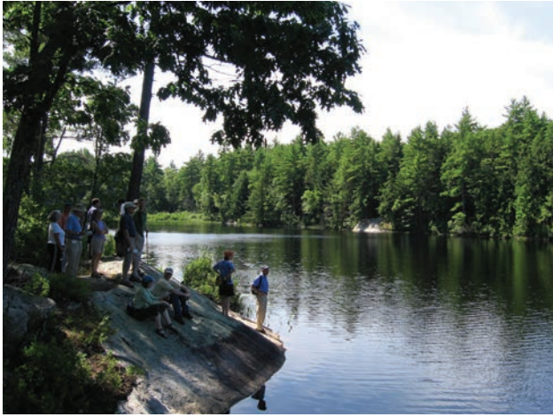
Mulligan Pond.

diverse and sometimes conflicting interests. Following extensive discussions within the family and with the Forest Society, the Fernald's agreed to sell a conservation easement at a price of $1.25 million, generously discounted from the easement's full appraised value of $1.7 million. They knew the project had to be affordable for the Forest Society to succeed. As an extra benefit, they also knew that their $475K charitable contribution of easement value could provide a federal income tax deduction that would help offset the capital gains tax they expected on the sale portion of the project. Rick, Deb, and Jim came to realize that if they didn't act while they still had control and a unified vision for the land, the opportunity to protect Mulligan Forest might never come again.