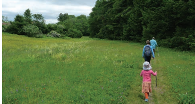
Cranberry Meadow Pond, Peterborough NH.

Walk through the process from start to finish. Included in this guide is a list of thoughtful questions to help you determine which options are the best fit for you.