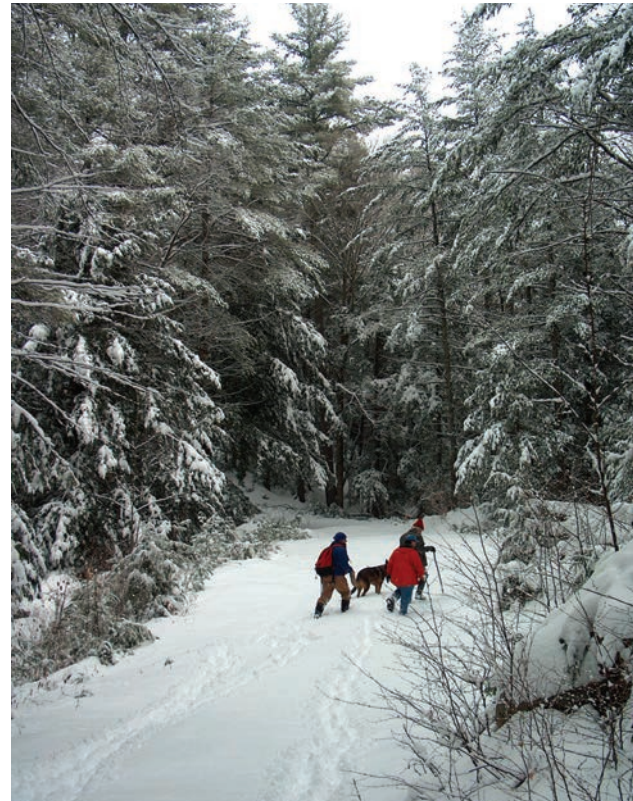
Mulligan Forest.

The property had additional outstanding conservation features. At the time, Mulligan fed wood to the adjacent Fernald Lumber Company, a sawmill and retail lumber outlet owned and run by Jim and Linda Fernald, and the town's largest employer. Mulligan also had a large stand of ancient black gum trees, 350 acres of wetlands and ponds, rare animal species, linkages to abutting conservation lands, an aquifer protecting public drinking water supplies, scenic road and river frontage, and historical features. Seven miles of trails and woods roads provided great opportunities for pedestrian recreation including hunting and fishing—all within a 45-minute drive of Manchester, Concord, and Portsmouth. The easement's terms would guarantee pedestrian public access and give the Forest Society the right to construct and maintain related improvements, including a parking lot, kiosk, and more trails. The easement would also reserve to the Fernald's the right to extract and sell groundwater, but only for a public drinking water supply. The Forest Society initiated a full-scale, two-year-long fundraising campaign, with key local assistance from the Nottingham Conservation Commission and land trust partner Bear-Paw