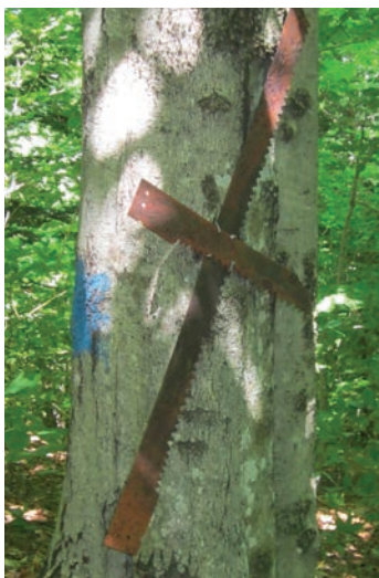
A broken crosscut saw provides a novel boundary marker.

So, what does “legal responsibility” mean? It is a promise the land trust makes to ensure the conservation values are not degraded over