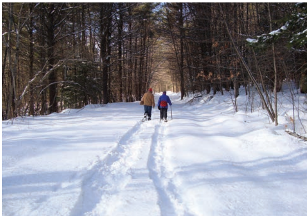
Courser Farm lands.