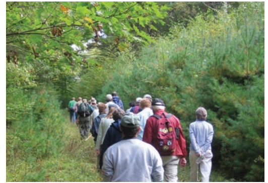
Mulligan Forest field trip.

Regional Greenways. Major grants came from public and private funders, including the NH Land and Community Heritage Investment Program (LCHIP). Local residents provided critical support individually and via their passage of an $850K bond at Nottingham's 2006 Town Meeting. Their overwhelming 96% approval set a precedent statewide for municipal votes for large land conservation funding proposals. The Mulligan Forest ballot item also helped generate the highest town meeting turnout in Nottingham's history.