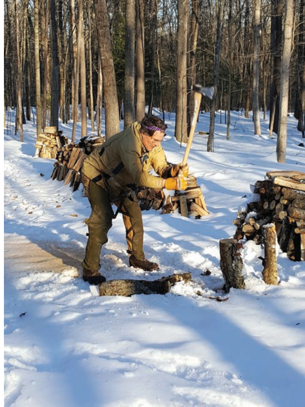
Working up next year's firewood on the Howe-Thorne easement (Five Rivers Conservation Trust) in Gilmanton NH.

Similar to other real estate transactions, conservation projects conclude with final signing and delivery of the deed for your land or conservation easement, sometimes referred to as the "closing." The land trust