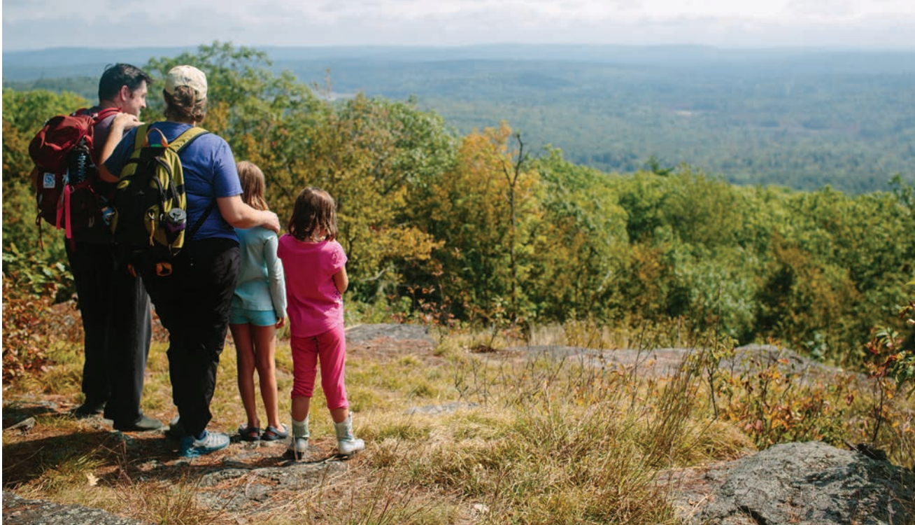
Phoebe's Nable, Moose Mountain Reservation (2,475 acres) in Middleton/Brookfield. Protected by the Society for the Protection of NH Forests and Moose Mountain Regional Greenways.