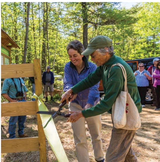
Celebrating the opening of new trails at Mast Road Natural Area, a 525-acre property conserved in 2011 and now owned by Southeast Land Trust of NH.

To enable the land trust to devote significant time to your project, landowners are often asked to sign a formal agreement which stipulates general roles, responsibilities, timeline, and other terms required to produce your conservation outcome. When a sale is anticipated, the land trust will want to sign a Purchase and Sale Agreement with you, establishing a legally binding contract defining such key items as sale price, and activities to be undertaken