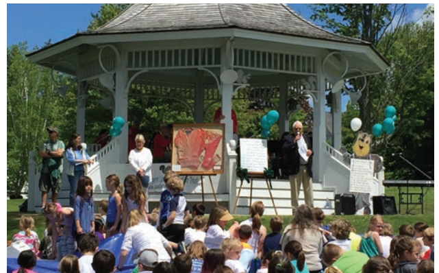
ASLPT holds an “Ausbon Sargent Day” for grades K-5 every five years on Sargent Common when they celebrate milestone anniversaries.