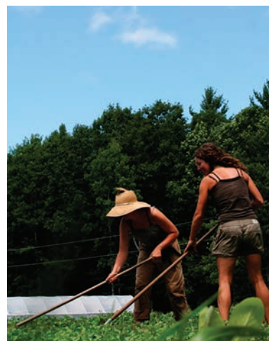
Working at Tracie's Community Farm.