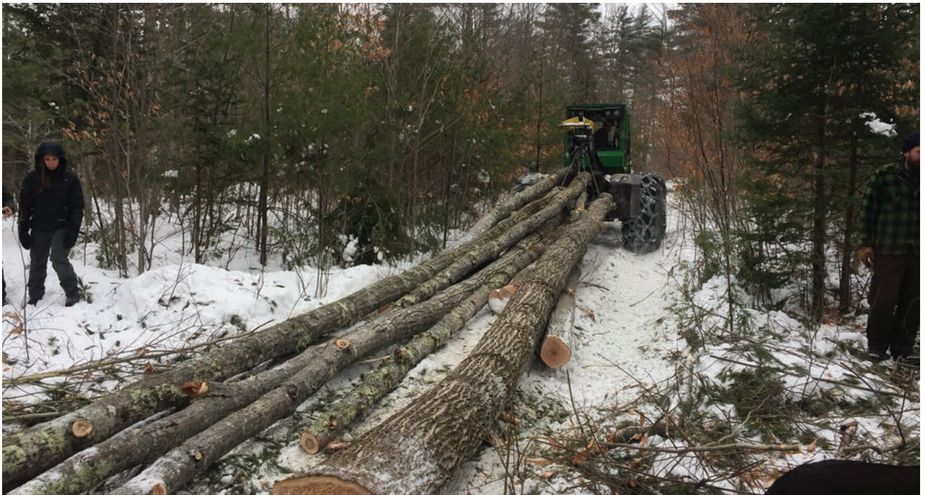
Conserved lands can be working lands. Here a winter timber harvest takes place on the Collidge Beede Forest in Sandwich.

The executor of a landowner's estate may donate a conservation easement even if the landowner's will doesn't direct the executor to do so. Several conditions must be met, including approval by all the heirs and inclusion of specific wording in the conservation easement. The executor can make the gift up until the due date of the estate tax (usually nine months after death). This option may allow the heirs and estate to reduce or even eliminate federal estate taxes, to the extent they may apply. This option may also be helpful