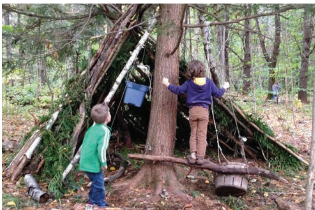
A fort built by kids on the Allen Family Farm.

Teachers at the Marlborough School had been actively using the property as an outdoor laboratory and classroom while the cross-country team ran on the trails. The afterschool program took the children out each week to collect large sticks and build tree forts.