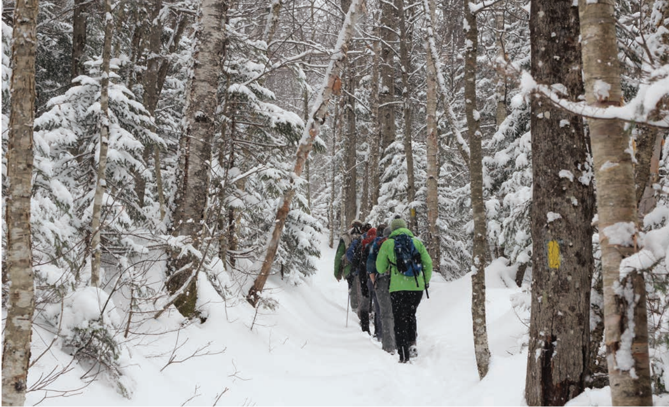
A group of hikers enjoys winter trails on conserved land in northern New Hampshire.

If you make a full donation or bargain sale of your property to a land trust, the conveyance may provide you with federal income and estate tax benefits. In some cases, a bargain sale may yield the same financial result for you as selling at full value because of the tax advantages (See Section 3 - Tax Benefits ).