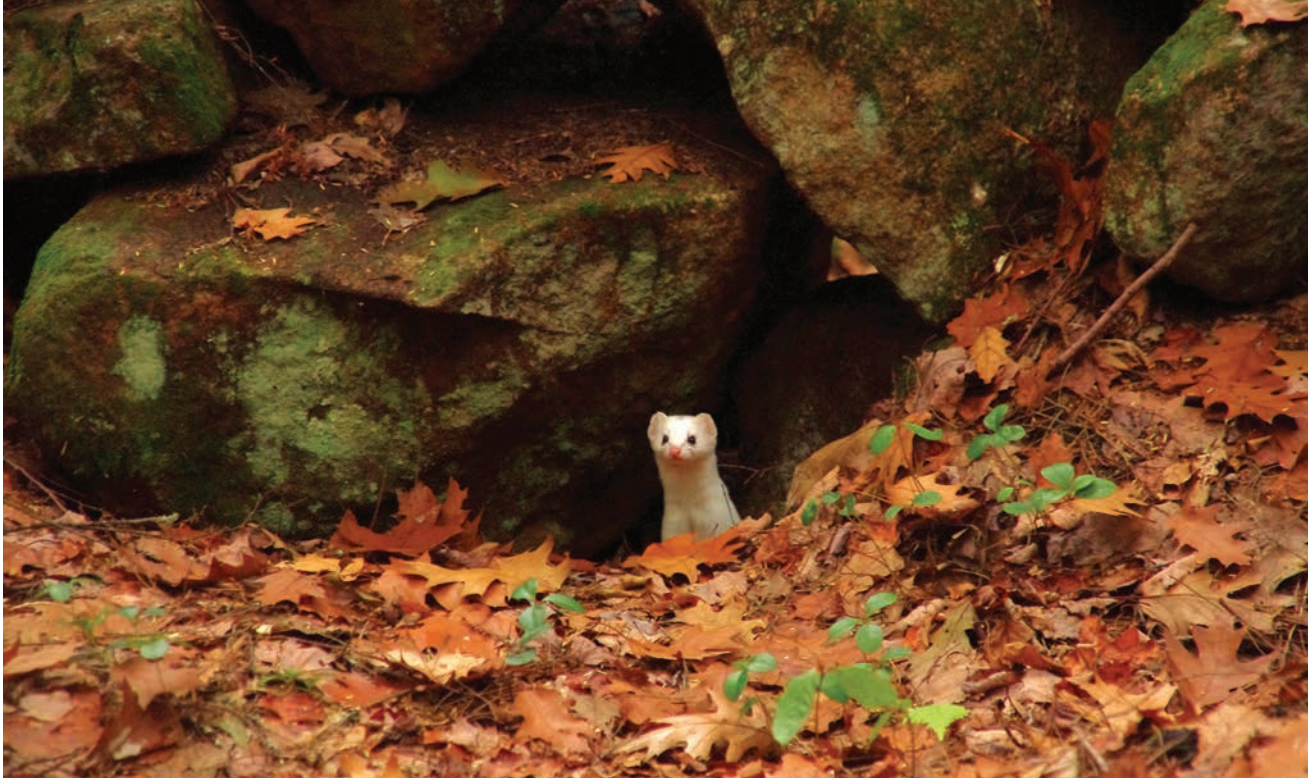
Ermine on Devan Preserve Marlborough NH.

Devise. To give land or a conservation easement by the terms of your will.