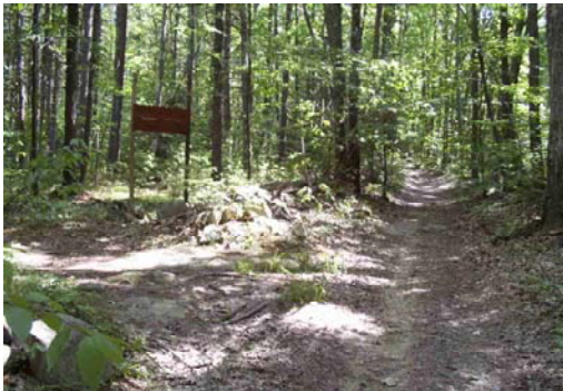
Herrick Woods, Chester

It is the policy of the District to work with individuals and towns that want to protect property for future generations. The district currently holds conservation easements on over 2,900 acres around the county. Easements are found on a salt marsh, agricultural land, town-owned land, forest, and lands protecting exemplary communities such as the source of the Exeter River or a portion of the Winnicut River. The donation of a conservation easement is a major commitment for any landowner. Although tax benefits may result from such a gift, the primary reward